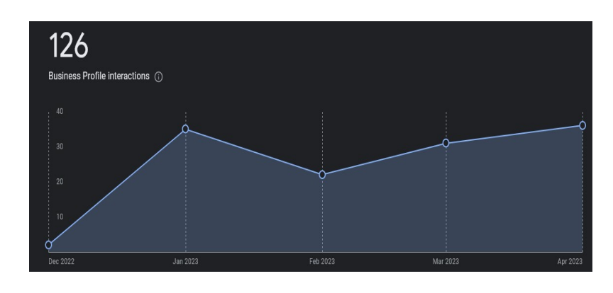
Results – Google Business Interactions (90 Day)